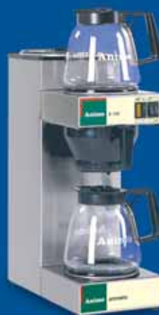
B 100 / B 200