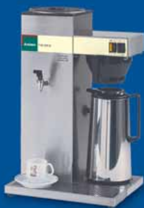
TVB 200 W

The B 200 WF is a very versatile brewer. Standard features are: fixed water connection, advanced automatic temperature control, separate hot water boiler with tap for tea etc., audible warning system when brew is ready. The B 200 WF is equipped with a preference switch, so that the appliance does not have to be connected to high power current.