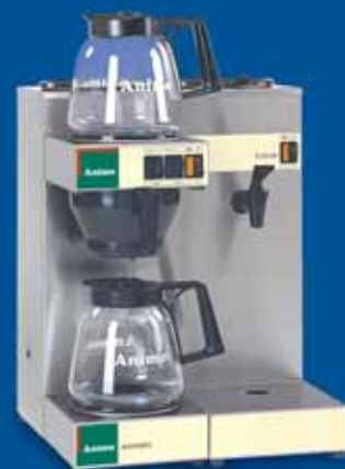
B 200 WF