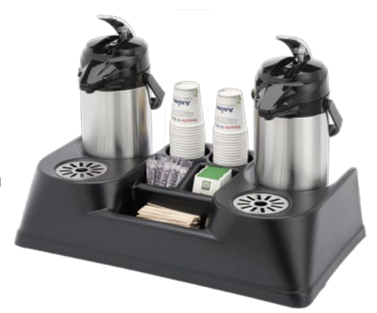
Thermos jug buffet

Every coffee drinker has his/her preferences. That is why there are often loose sugar packets, coffee stirrers and coffee cream on the table. Sometimes, tea bags in various flavours are added as well. Animo helps you to keep your serving table clean, well-organized, and inviting.