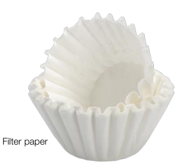
Naturally, Animo also offers the following accessories: