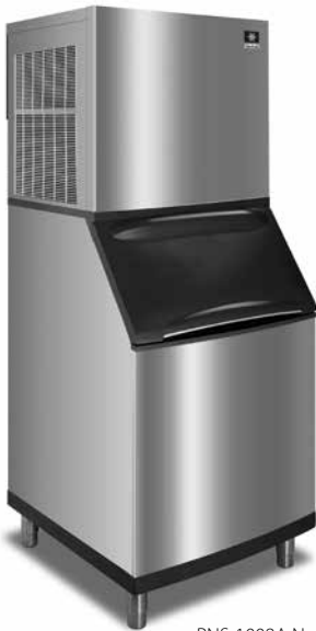
RNS-1008A Nugget Ice Machine on B-570 Bin