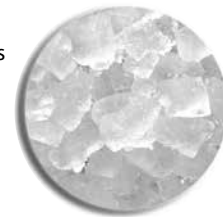
Ice shown actual size

Nugget ice consists of small pieces ranging from 3/8" to 1/2" in width and length. Offers a 90% ice to water ratio with a soft, chewable texture while still providing maximum cooling effect and dispensibility.